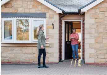
Home Delivered Meals Drivers