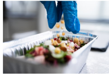
Meal Site Kitchen Support Manitowoc (16+ years)