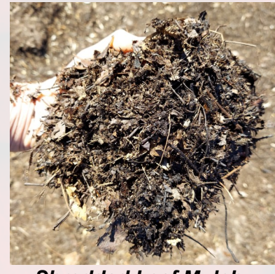
Shredded Leaf Mulch