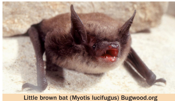
Little brown bat ( Myotis lucifugus )