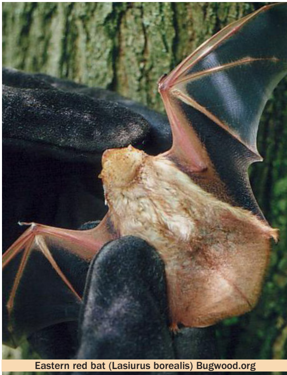
Eastern red bat ( Lasiurus borealis )

Because rabies is a fatal disease, the goal of public health is, first, to prevent human exposure to rabies by education and, second, to prevent the disease by anti-rabies treatment if exposure occurs. Tens of thousands of people are successfully treated each year after being bitten by an animal that may have rabies. A few people die of rabies each year in the United States, usually because they do not recognize the risk of rabies from the bite of a wild animal and do not seek medical advice.