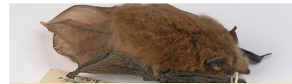
Common pipistrelle ( Pipistrellus pipistrellus ) Bugwood.org

Wisconsin Department of Agriculture, Trade and Consumer Protection