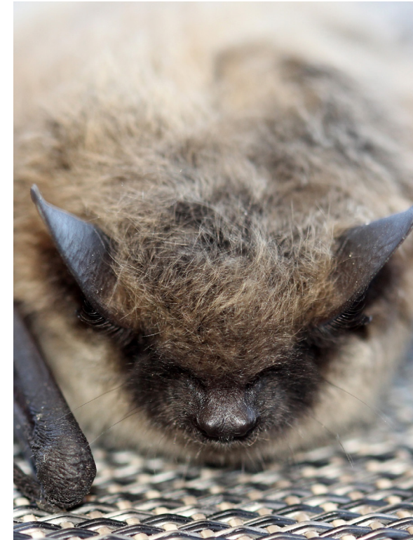
Little brown bat ( Myotis lucifugus )