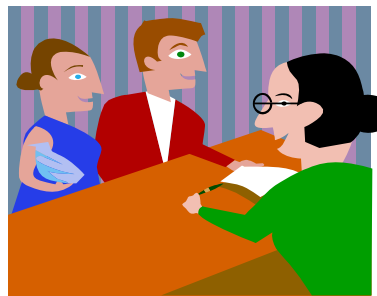
Hearing conducted by Planning Commission

We recommend that you attend the public hearing, as the Planning Commission may have specific questions concerning your request. In addition, parties for and against your request are given an opportunity to speak at the hearing.