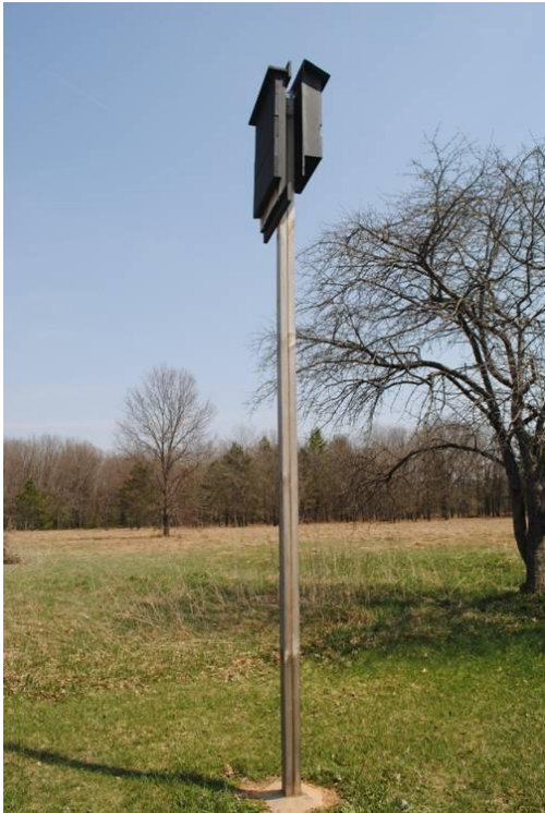
Two types of bat houses

success. As bats come and go, they will become familiar with the structure. Upon exclusion, this familiarity will provide the best possible chance for the successful inhabitation of the bat house by the recently excluded bats. If you are interested in purchasing or building bat houses, contact the Wisconsin Bat Monitoring program. The program staff can help you decide on where to purchase the best bat house design with proven success. The Wisconsin Bat Monitoring program can also give you instructions for building your own bat house. Read our information pamphlet titled: "Building a Bat House" to learn how to build and locate your bat house. Location and design are critical pieces as bats are more difficult to attract to a bat house than birds are to a bird house.