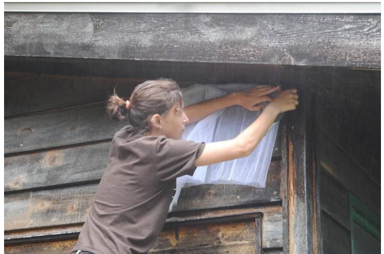
Applying screen for one-way door

One-way exclusion devices can be created using plastic netting with one-sixth inch (0.4 centimeter) or smaller mesh. Shape the plastic netting so that it covers the opening entirely and extends at least two feet below it. Using staples or duct tape, attach the top and side edges of the