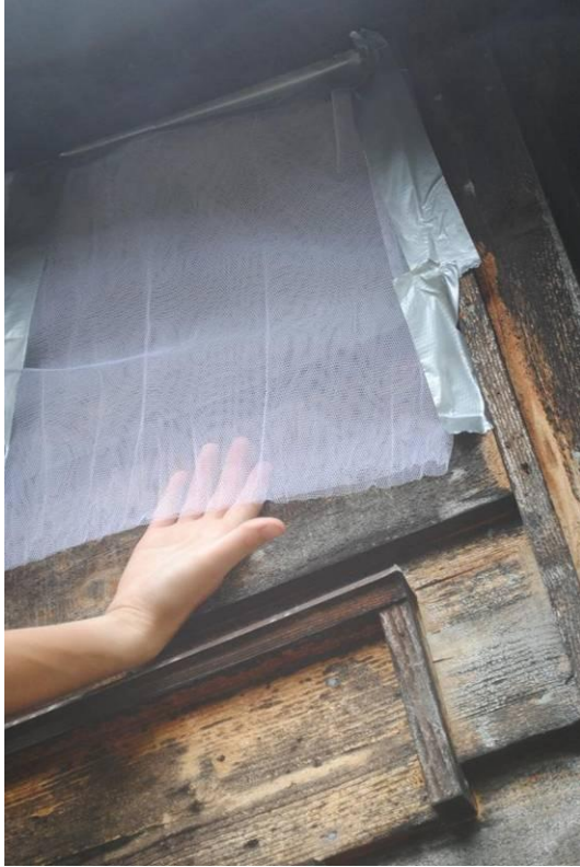
Space on bottom for bats to escape

Remember that bats will not chew their way back inside your house. So, after you've found and sealed all of the access points you will have successfully excluded the bats from your living space.