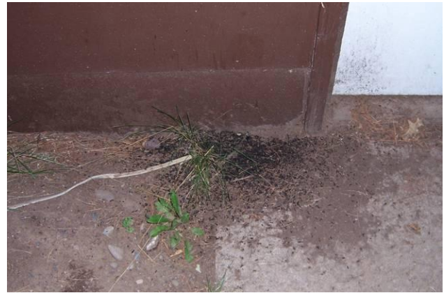
Bat guano in front of garage

Visible signs such as staining and guano (bat droppings) will also help identify openings. The body oils of bats can cause