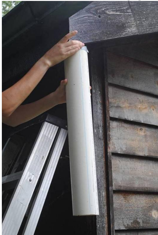
PVC one-way door

Other materials can be used to create one-way exits, such as plastic sheeting or PVC pipe. Install the plastic sheeting in the exact manner as the plastic netting. A portion of PVC pipe, which should be similar in size to a tube of caulk, can be inserted into the opening. Seal the